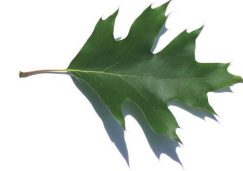
Northern Red Oak