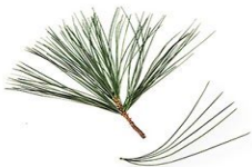
Eastern White Pine